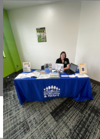
Baltimore County Recreation & Parks