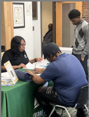
Baltimore City Recreation & Parks