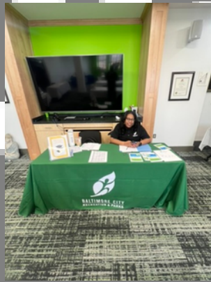
Baltimore City Recreation & Parks