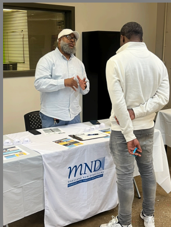
Maryland and New Directions