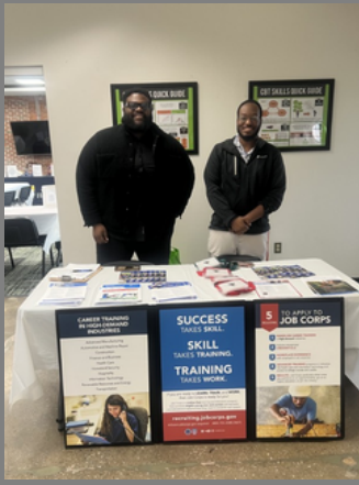
Woodland Job Corps Center Staff